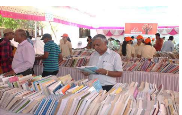
{\it The MMB exhibition setup and teachers browsing through the books displayed at the venue}