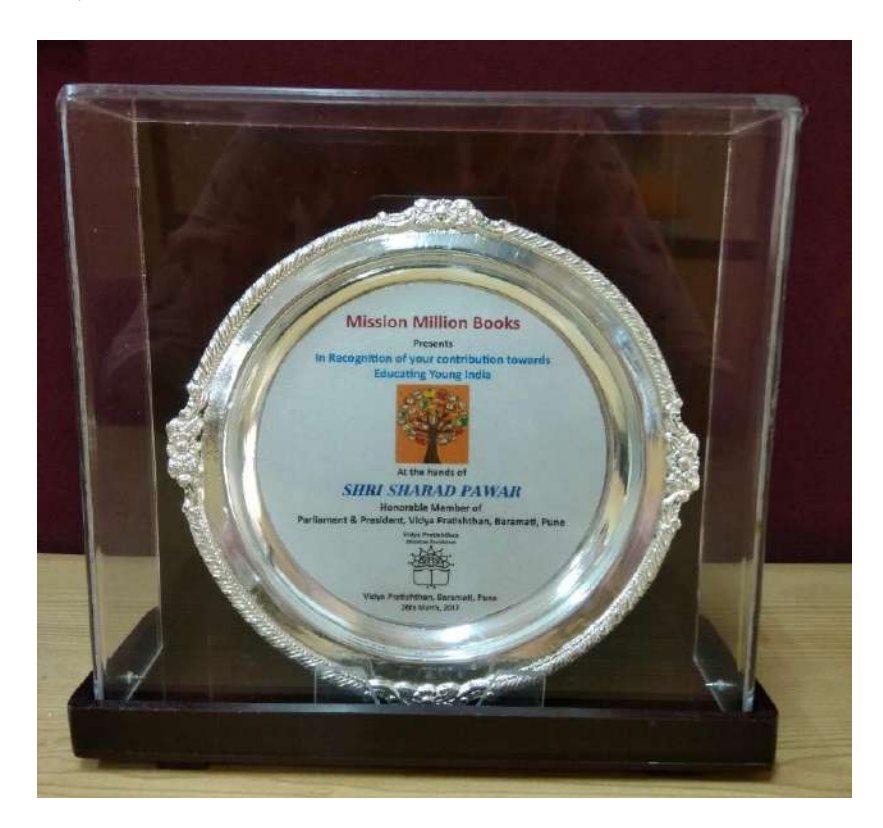
Trophy handed over to the dignitaries.